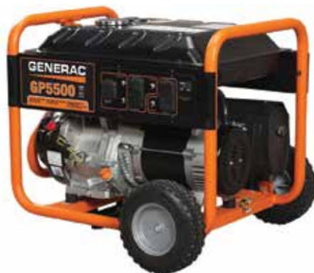
Generac 5500 Watt Pull Start *$620.00 ($678.13 with tax)

Portable generators and a welder/generator are available to members for purchase, with financing available to qualified members.