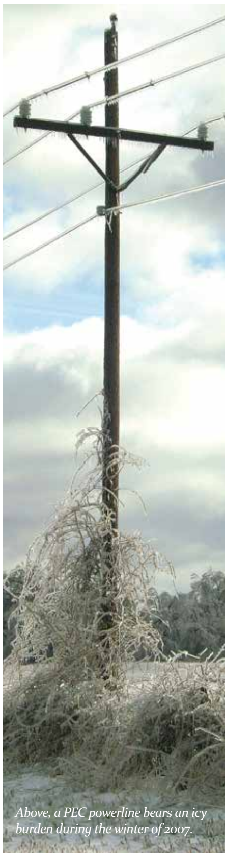
Above, a PEC powerline bears an icy burden during the winter of 2007.

It's hard to predict the Oklahoma weather and the dreaded havoc it can take on our service area. With one of the best service statistics in this region, PEC takes great pride in the hard work and advancements continually being made to provide reliable and affordable electricity to the more than 21,000 meters we serve. 0472900300