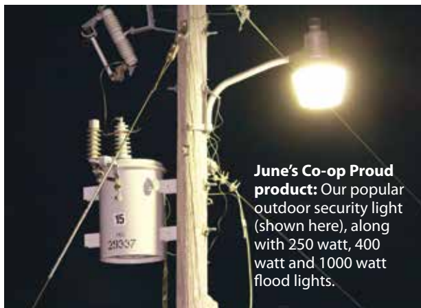
June's Co-op Proud product: Our popular outdoor security light (shown here), along with 250 watt, 400 watt and 1000 watt flood lights.

PEC-installed security lighting is not only the most convenient way to light up the exterior of your home, it's also economical.